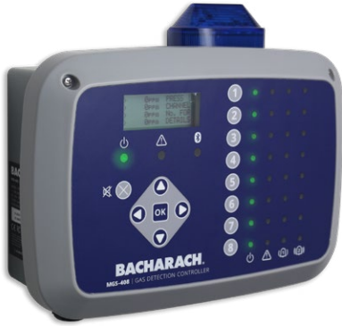
(Pictured with optional strobe configuration)

For Safety Compliance in Refrigeration Applications