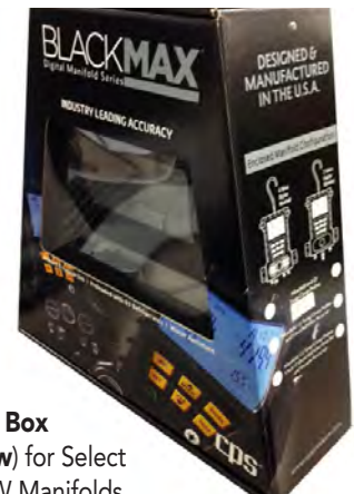
Distinctive Display Box (With Clear Window ) for Select MD50W & MD100W Manifolds