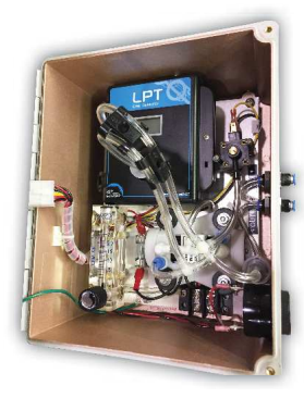
Inside of the DCC-SD showing an LPT-A gas detector mounted inside the enclosure.

Caution: The DCC-SD sample draw system should not be used inside classified hazardous areas or to sample draw combustible gases because the pump is not intrinsically safe.