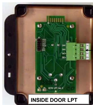
INSIDE DOOR LPT

INTERNAL ELECTROCHEMICAL NO 2 SENSOR AND SPLASH GUARD