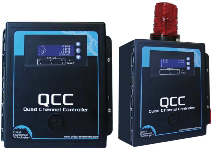
QCC shown with Options L and SW

The QCC Quad Channel Controller offers four channel configurations for monitoring toxic, combustible and/or refrigerant gases with versatile control functionality for non-hazardous, non-explosion rated, commercial and light industrial applications. It is designed to accept inputs from up to four remote digital and/or analog transmitters using digital or 4-20 mA analog input. The QCC is available in two models, the QCC-M with Modbus® RTU RS-485 output or the QCC-B with BACnet® MS/TP RS-485 output for communicating with a Building Automation System (BAS).