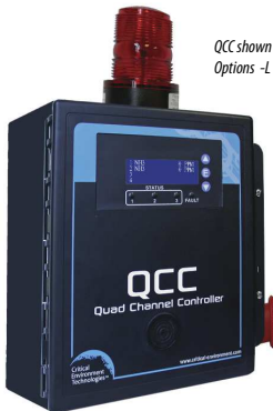
QCC shown with Options -L and -SW.