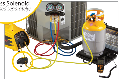
Manual or Automatic RECOVERY

SVW Wireless Solenoid (Purchased separately)