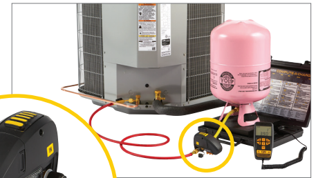
Manual or Automatic CHARGING

Pair The CC220EW To The CPS Wireless Solenoid Valve (SVW) Accessory For: