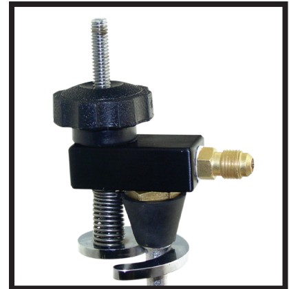
#12 Universal couplers