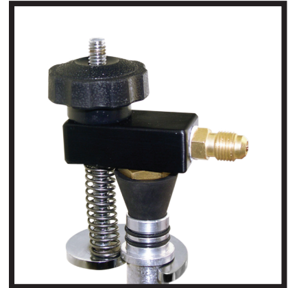
#6 Universal couplers