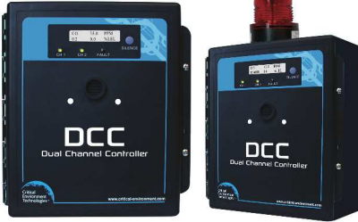
DCC shown with Option L

The DCC Dual Channel Controller is a comprehensive and dependable, self-contained system that offers one or two channel configurations for monitoring toxic and combustible gases and PID TVOCs with straightforward control functionality for non-hazardous, non-explosion rated, commercial and light industrial applications.