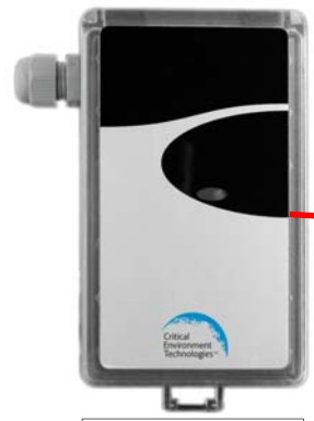
AST-IS18 WITH INTERNAL CO2 SENSOR

DAISY-CHAIN POWER & GND WIRES RUNNING TO ADDITIONAL AST-IS18 TRANSMITTERS. NOTE THAT ONE SIGNAL WIRE MUST BE PULLED FOR EACH ADDITIONAL TRANSMITTER ADDED.