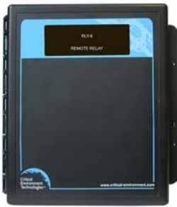
RLY-8 Remote Relay With 8 relays End of Line Jumper