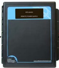
RPS-24VDC Remote Power Supply