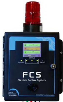
Installer supplied Line Voltage Power