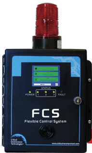
FCS shown with Options DL, L and SW